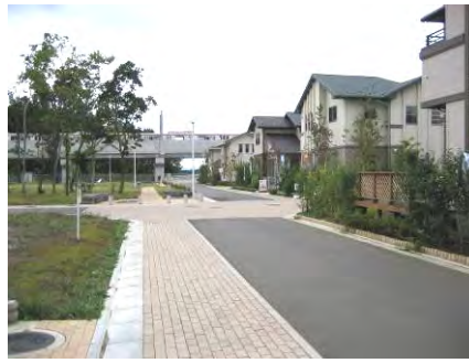
Avenue ( District park on the left )