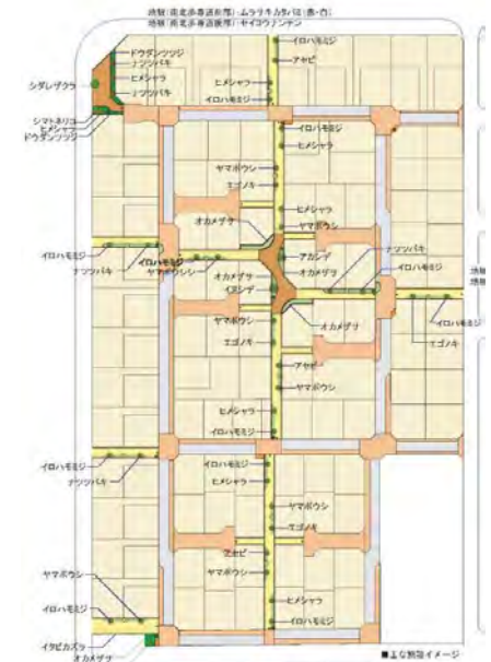
Landscape plan for E-39 district in the Katsuragi area (S-1/2500)