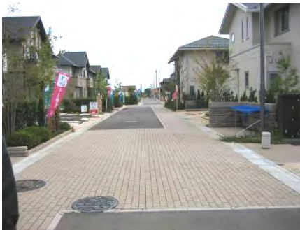
Avenue in residential area