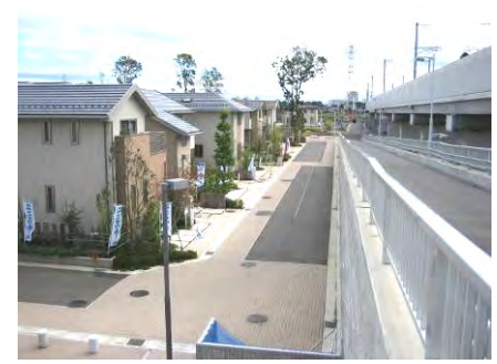
Residential area ( From side walk & pedestrian )

Ordering party : Urban Renaissance Agency / Ibaraki local office