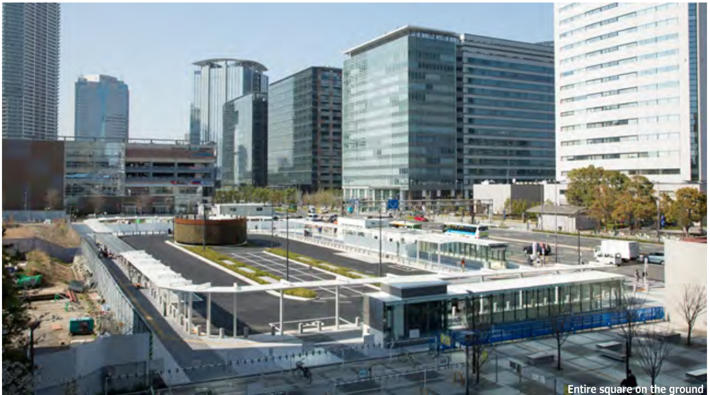
Entire square on the ground