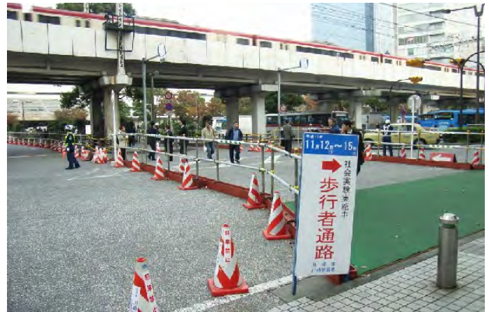
Social experiment on the east side of Kawasaki Station