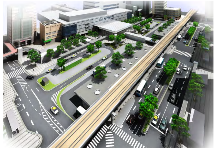
Basic design for redevelopment for the east side of Kawasaki Station