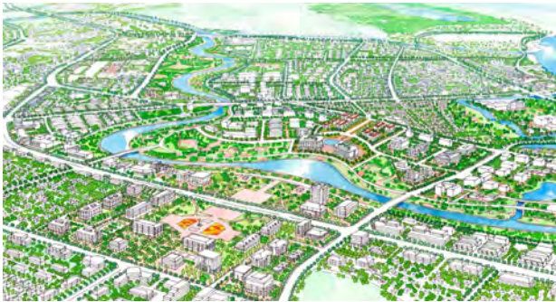
Cau Rao River development