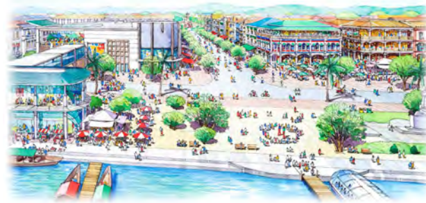
Dong Hoi market area