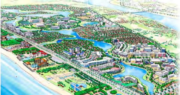
Bao Ninh Resort & New City