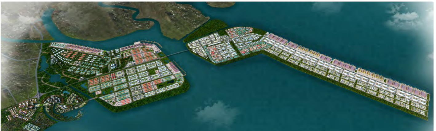
Lach-Huyen Port and DinhVu Port