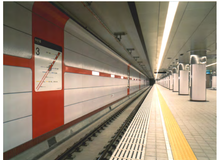
Hisaya-odori Station (Transportation Bureau, City of Nagoya Sakura-dori Line) Nagoya City Opened:1989