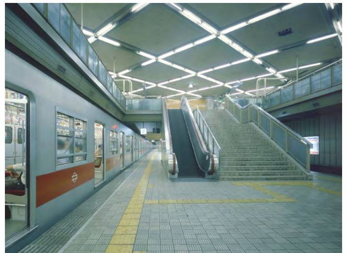
Senri-Chuo Station (Kita-Osaka Kyuko railway Kita-Osaka kyuko Line) Suita City, Osaka Opened:1970