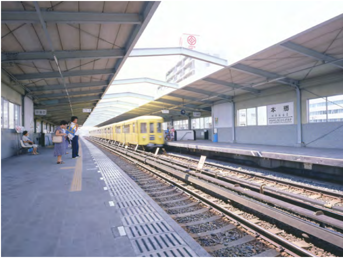
Hongo Station (Transportation Bureau, City of Nagoya Higashiyama Line) Nagoya City Opened:1969