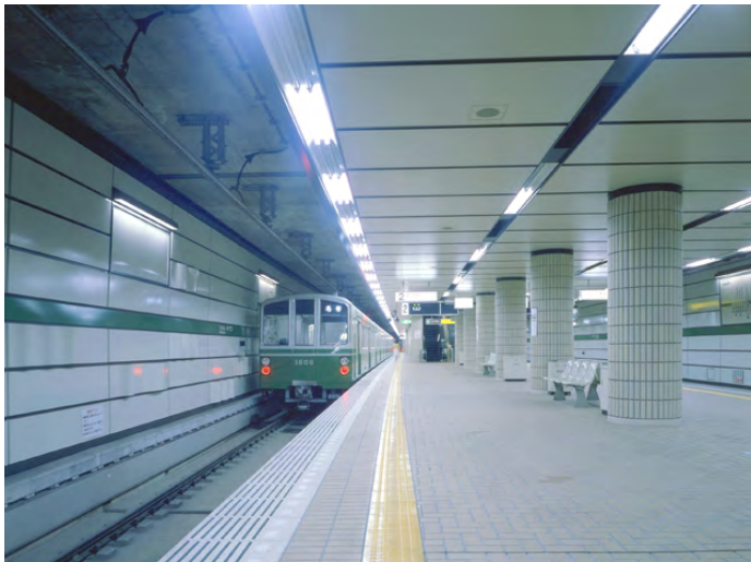
Okurayama Station (Kobe City Transportation Bureau Subway shin-yamate Line) Kobe City Opened:1983