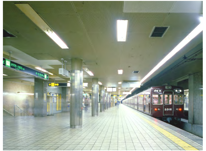
Sakaisuji-Hommachi Station (Osaka Municipal Transportation Bureau Sakaisuji Line) Osaka City Opened:1969